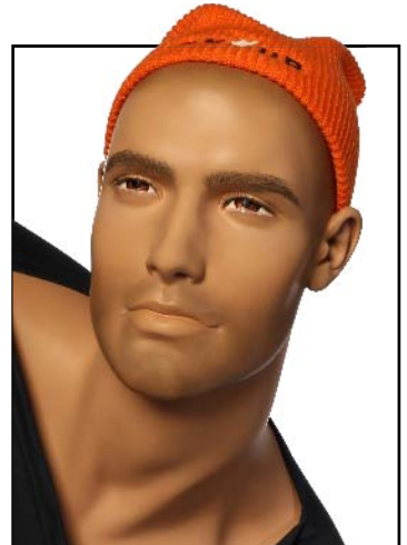
Conrad/1 Body colour: California Make-up: MU301 Hair shading