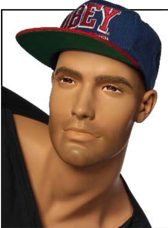
Conrad/1 Body colour: California Make-up: MU301 Hair shading