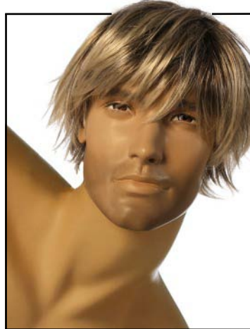
Conrad/1 Body colour: California Make-up MU301 Wig: Björn

When using regular trousers, use Continental size 52, UK 42 = Waist 87 cm/34" cm.