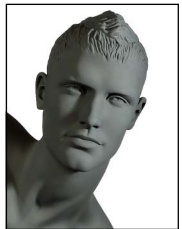
Conrad/2 Body colour: Dark grey suede look