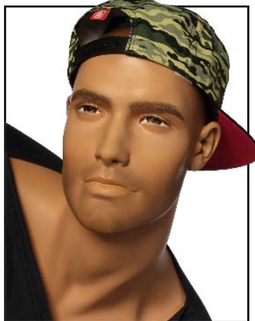
Conrad/1 Body colour: California Make-up: MU301 Hair shading