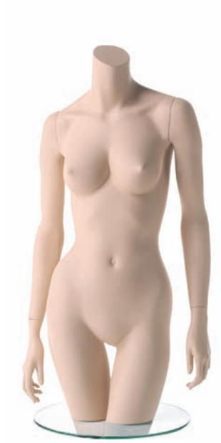
20117000301426 cup C height 98 cm chest 94 cm waist 63 cm hips 88 cm