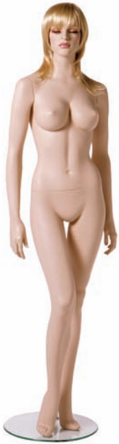
19160153310426 cup C height 183 cm neck 30 cm chest 94 cm waist 63 cm hips 90 cm