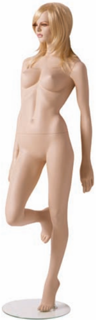
19160853310426 cup C height 183 cm neck 30 cm chest 94 cm waist 63 cm hips 90 cm