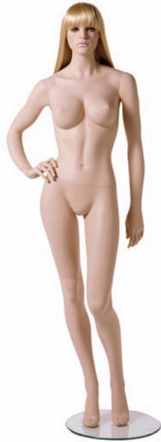
19160253310426 cup C height 183 cm neck 30 cm chest 94 cm waist 63 cm hips 90 cm