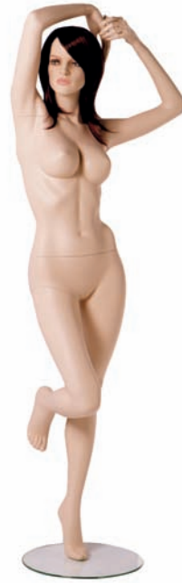
19160353310426 cup C height 183 cm neck 30 cm chest 94 cm waist 63 cm hips 90 cm