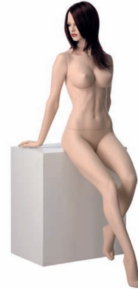
19161011100426 cup C height 165 cm neck 47 cm chest 91 cm waist 65 cm hips 100 cm