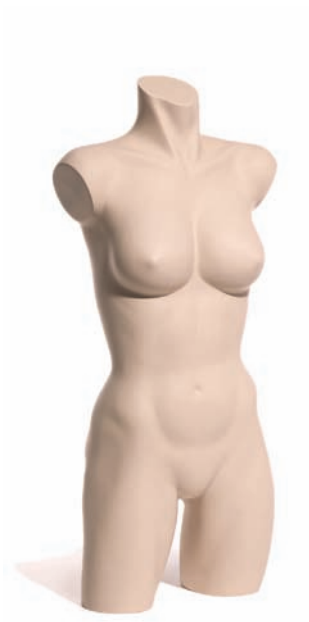
20117000301426 cup D height 92 cm chest 93 cm waist 66 cm hips 87 cm